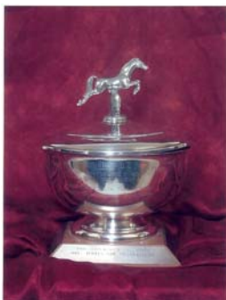
Zellerbach Junior Jumper Challenge Trophy